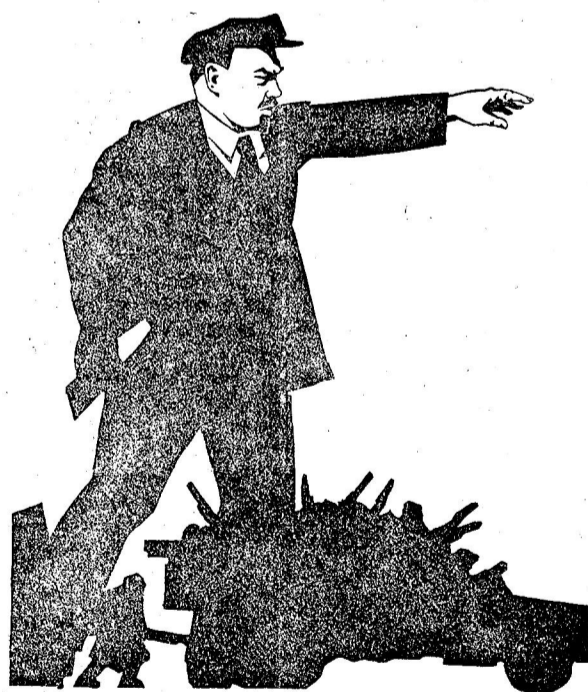
The Spirit of the Revolution