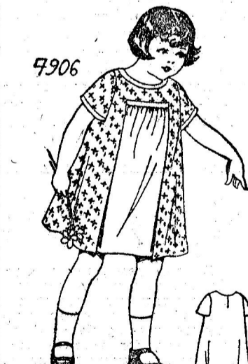
A PRETTY FROCK FOR A LITTLE MISS

Pattern mailed to any address on receipt of 12c in silver or stamps. Send 12c in silver or stamps for our UP-TO-DATE FALL & WINTER 1924-1925 BOOK OF FASHIONS.