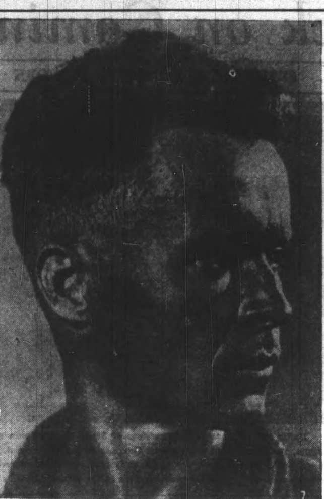
Alexander Dovzhenko, director of the new Soviet picture, "Frontiers," (Air City), coming to the Cameo Theatre on Dec. 24.