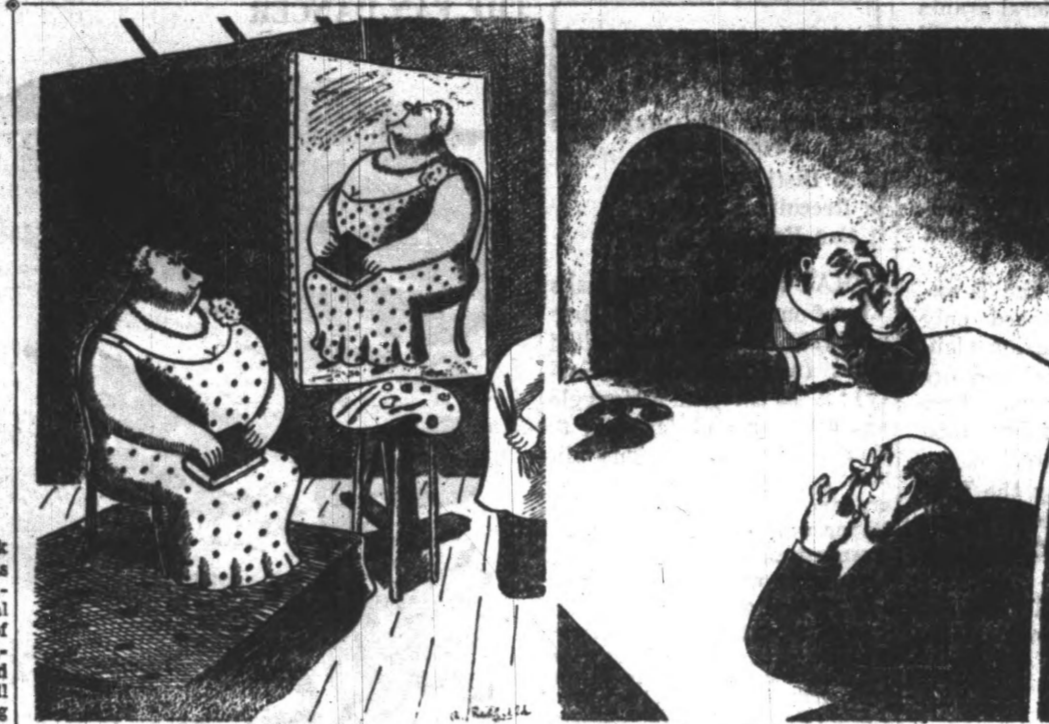
Two drawings from "The Ruling Clawss"