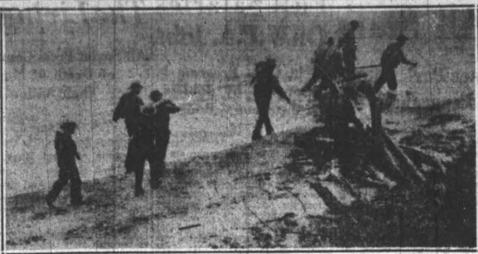
Testing whether troops could attack strikers without being seen, these soldiers advanced upon chemical smoke screen bombs thrown by themselves entirely untried by the "enemy" along the shore.