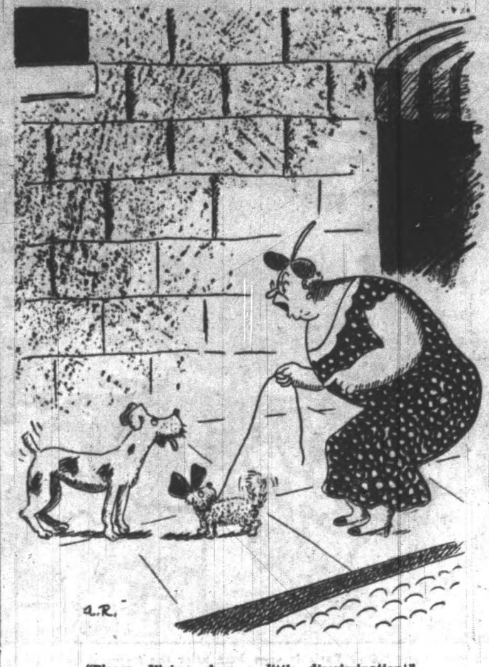
"Please, Vivian—show a little discrimination!"