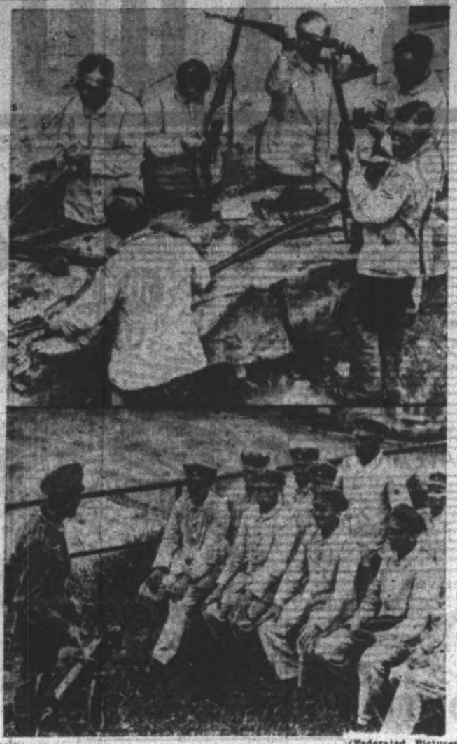
Determined to provoke war, Adolf Hitler is building up the strength of the army's reserve corps. The upper picture shows reserve soldiers getting training in the cleaning of guns, while officers (lower) get instructions in the handling of new machine guns.