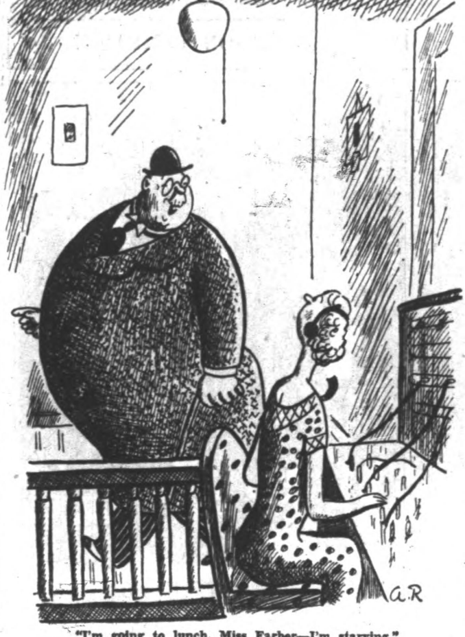
"I'm going to lunch, Miss Farber—I'm starving."