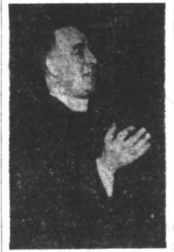
RADIO PRIEST IN ACTION