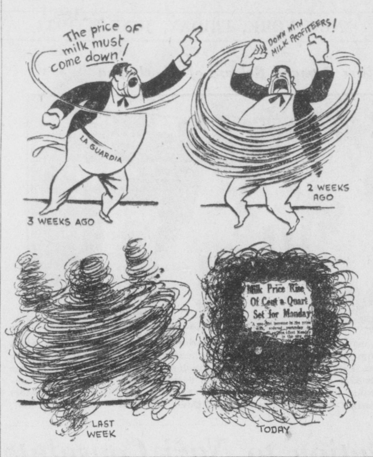
3 WEEKS AGO, 2 WEEKS AGO, LAST WEEK, TODAY