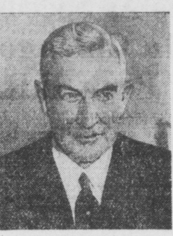
NEW REPUBLICAN CHIEF Henry P. Fleicher, newly elected as Chairman of the Republican National Committee, is closely bound up with the Mellon and Reed interests in Pennsylvania. He has connections with many of the same big financial interests now supporting the Roosevelt administration.

He will speak in Hamilton, Ohio, Saturday, June 9, at 7:30 p.m., on the Court House steps. On Sunday, June 10, at 7:30 p.m., in Middletown, Ohio, at 1605 Garfield Place; in Cincinnati, Ohio, on Monday,