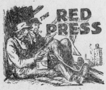
(THE LABOR DEFENDER)