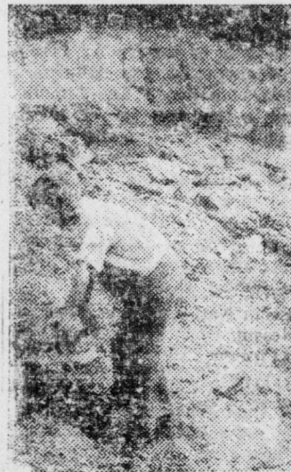
Photo shows child of unemployed coal miner in the Anthracite combing dumps for pieces of coal. His father slaved years at starvation wages to dig the coal — now he has been laid off and his family must freeze. Miners and miners' wives must fight for immediate unemployment relief and unemployment insurance.