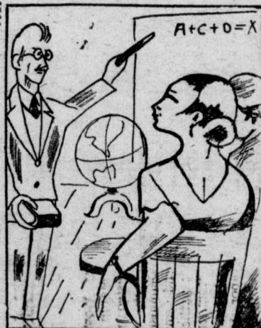
IN THE U.S.A. ONLY THE RICH CAN STUDY. WORKERS HAVE TO LEAVE SCHOOL AT AN EARLY AGE TO MAKE ALIVING.