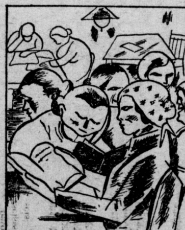
IN THE SOVIET UNION NIGHT WORK HAS BEEN ABOLISHED. WOMEN WORKERS HAVE THE 5 AND 7-HOUR DAY.