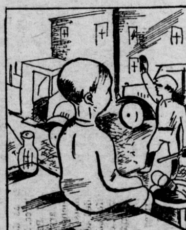
IN THE U.S.A. CHILDREN OF WORKERS MUST CARE FOR THEMSELVES. THEY ARE IN CONSTANT DANGER WHILE THE MOTHER IS AT WORK.