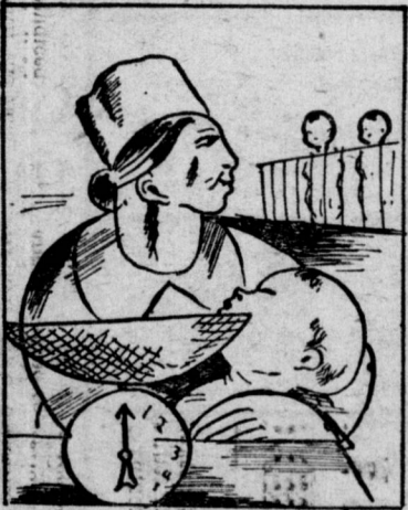
IN THE SOVIET UNION TRAINED NURSES CARE FOR THE CHILDREN OF WORKING MOTHERS.

An excellent opportunity for us to rally the women to our standards is presented by International Women's Day on March 8. This day will be the occasion for demonstrations and organization work of all kinds in every country. With even a little work on our part large numbers of women in American industry can be aroused in connection with the general movement and drawn closer to our program and organization. We must make International Women's Day a big success. It must be made the point from which a new era in our work among women will date.