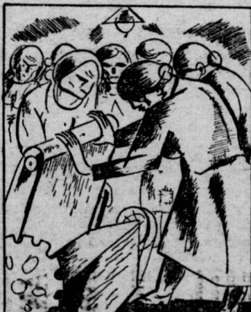
IN THE U.S.A. WOMEN NOT ONLY WORK LONG HOURS FOR LITTLE PAY BUT MUST DO NIGHT WORK UNDER INTOLERABLE CONDITIONS.