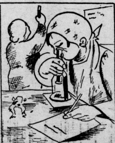
IN THE WORKERS' FATHERLAND THE WORKERS ARE THE ONES WHO SECURE EVERY CULTURAL ADVANTAGE.