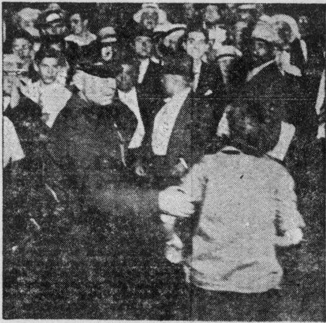
Women workers fought in many demonstrations and hunger marches on Feb. 10th and on Feb. 25th. Photo shows arrest of unemployed woman worker in a recent jobless demonstration.