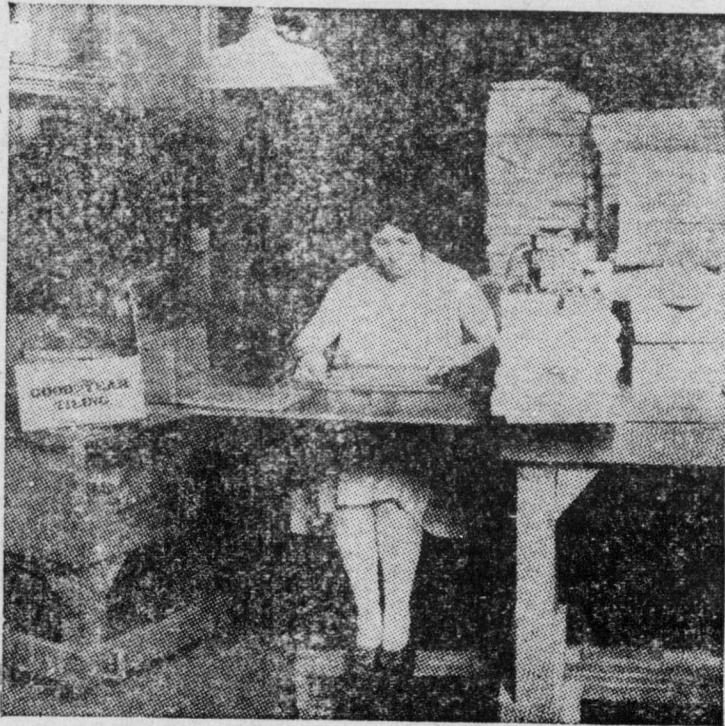
Woman worker in a Goodyear Rubber factory in U. S. A., working under speed-up for starvation wages. Hundreds of thousands of women workers are unemployed and starving in the U. S. A. More and more of them are joining the revolutionary trade unions to fight starvation.