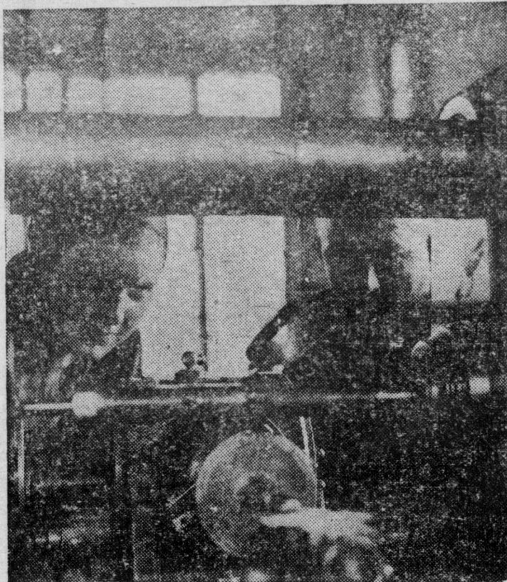
The Soviet workers run the factories. The women workers have special advantages, such as shorter hours, etc. They go to school in the factories they work in, as in the photo above, which shows women workers in the factory school at the Moscow Motor Car Factory. She is being trained to help direct the factory. See photo on next page for contrast in capitalist U. S. A.