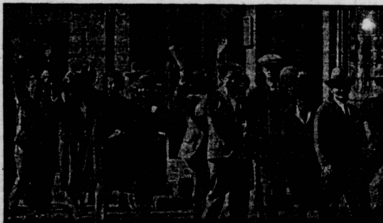
Photo shows women textile strikers side by side with men on picket line. Such mass picket lines are daily scenes in Lawrence, Mass., where 10,000 textile workers, under the leadership of the National Textile Workers Union, are on strike against speed-up and starvation wages.