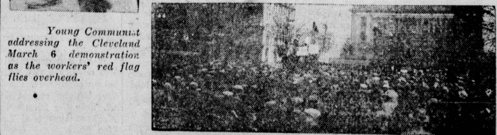
Young Communist addressing the Cleveland March 6 demonstration as the workers' red flag flies overhead.