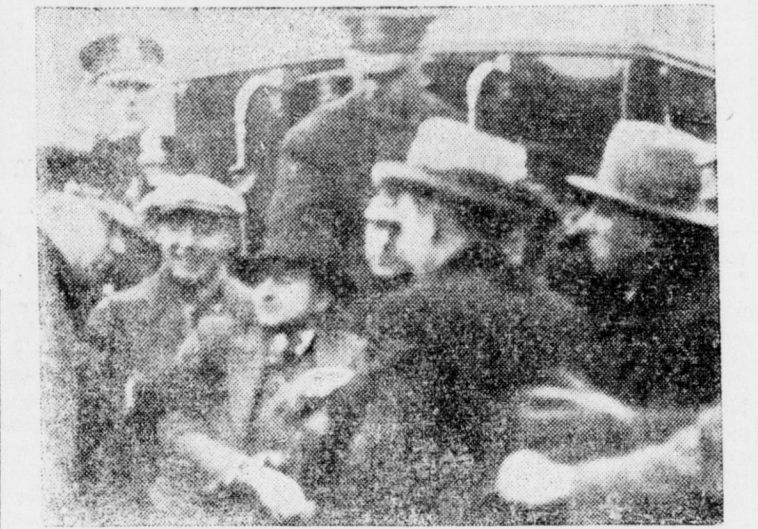
The Milwaukee "socialist" administration gave the workers of that city an object lesson in social-fascism. When thousands of workers, jobless and hungry, demonstrated against unemployment, police clubbed the demonstrators and arrested their leaders. Photo shows demonstrators being herded in the "Black Maria."