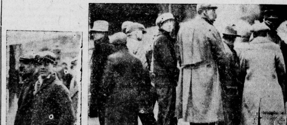
Types of young unemployed workers who demonstrated 200,000 strong on March 6 for work or wages. In the center of the above photo can be seen a young jobless worker warming himself over a fire in an empty lot. photo shows young jobless worker joining the second unemployment parade in "socialist" Milwaukee.