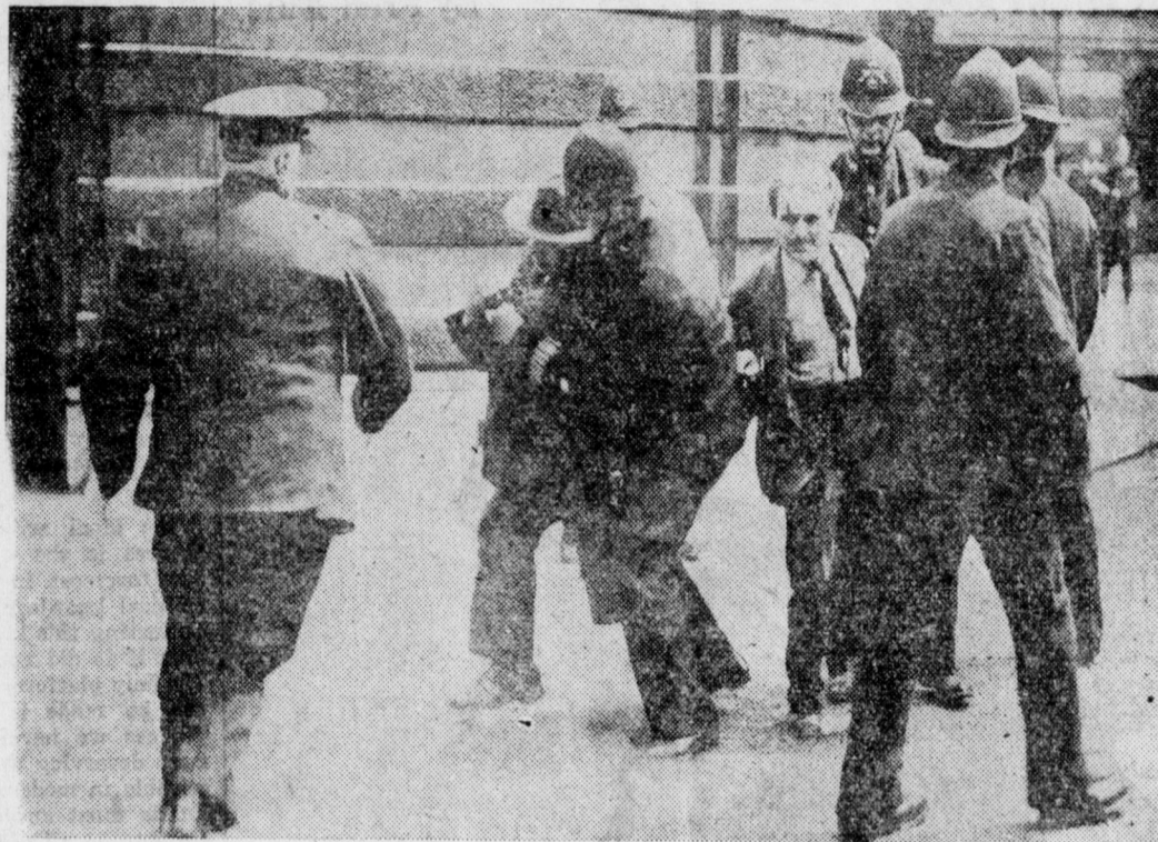
When a committee of British unemployed workers attempted to present their demands for relief to Margaret Bonfield, "labor" cabinet member, they were met by police attacks. In order to shield the open imperialist policy of the MacDonald Henderson, Snowden leadership of the "labor party," the Maxton-Wheatley fake "left" group carries on a mild criticism, designed to preserve faith in the "labor party."