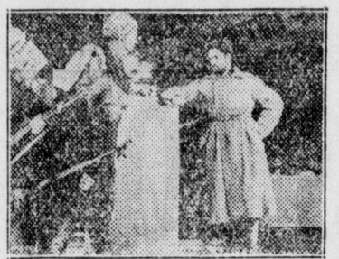
Scene from "Scandal?" the latest importation from the Soviet studios, showing at the Film Guild Cinema this week.