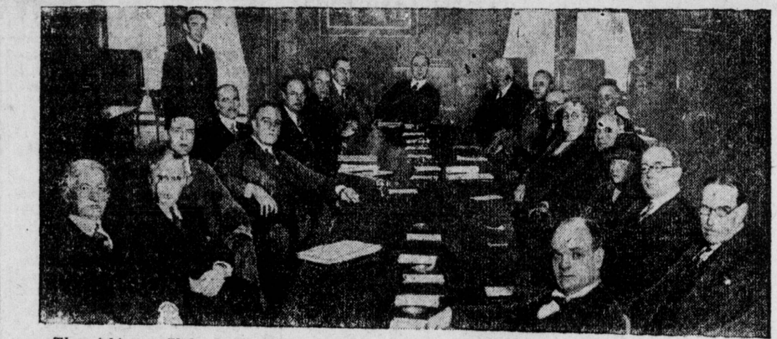
The pickings will be fertile for the new cabinet of New York, appointed by Tammany Governor Roosevelt of New York. The cabinet is shown with Roosevelt in above photo.

The convention of labor unions in session are demanding remedial action to enforce protective legislation and there is a united front of labor generally to this end.