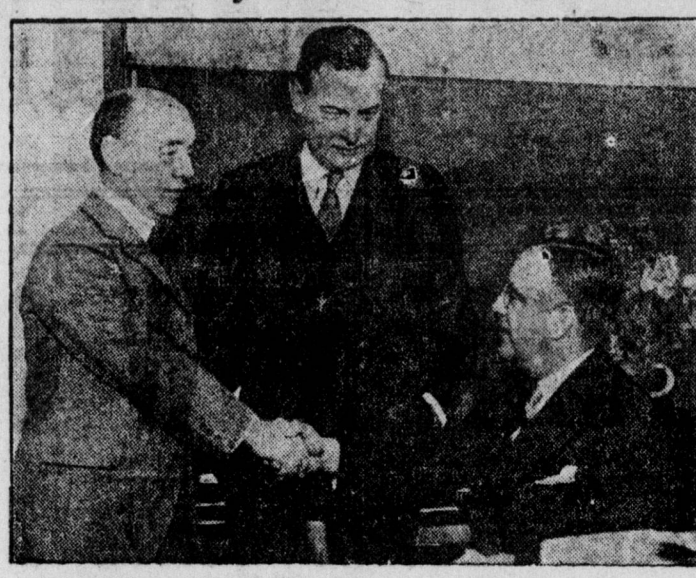
Photo shows Wm. J. Fullen, Tammany Hall's new state transit commissioner, receiving congratulations of Tammany politicians. The subway bosses will count upon him as a valuable ally in helping them to push the 7 cent fare steal thru.

To Aid Subway Bosses in 7-Cent Fare Steal