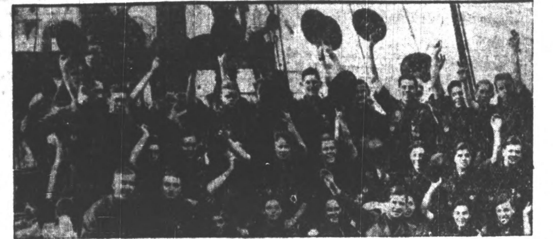
Great Britain and the United States are deadly imperialist rivals, but they are in perfect agreement on the necessity of training the youth in the school of patriotism.