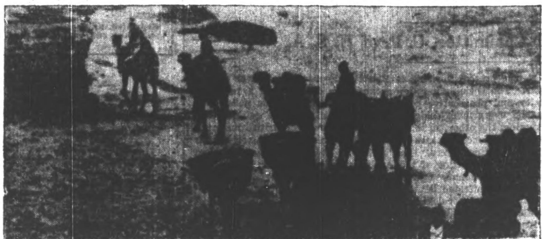
Fellakeen, or Arab land workers, who, robbed of their land by British imperialism, which handed it to the Zionists, imperialist tools, have revolted.