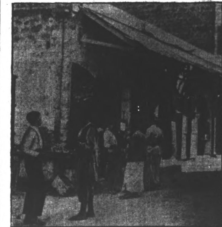
A scene in Jerusalem, where the Arab workers reduced to starvation by British imperialism and Anglo-Jewish capitalists started their rebellion.