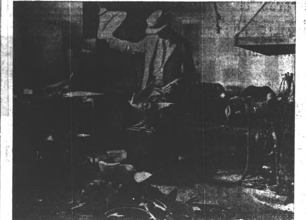
Four workers at the Brooklyn army base were badly injured when an acetylene tank exploded. Ruins after blast shown above.