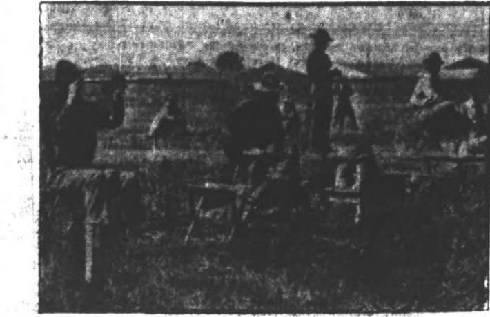
Infantrymen of the U. S. Army at Camp Perry, Ohio, at rifle practice. Wall Street is putting its troops through more intensive training than ever, as imperialist war draws nearer.