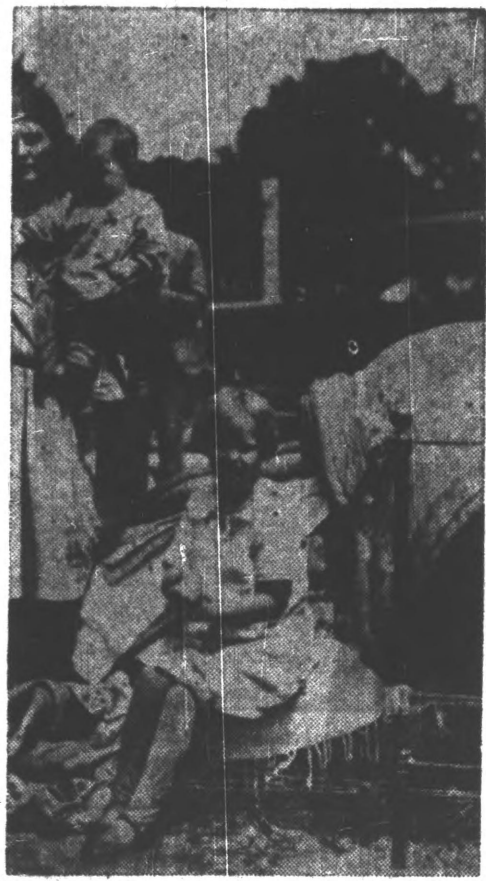
Gastonia, High Shoals and Elizabethton, Tenn., textile worker correspondents write on this page today. Above, evicted textile striker and her children.