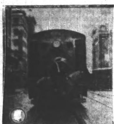
The open tracks on Eleventh Ave. still make that street, in a working-class neighborhood, Death Avenue for the workers' children, who lack dangerous streets on which the New York Central Railroad runs trains. Note the boy on horseback, employed by the railroad as signalman. The railroad fired an adult worker and hired the boy at a fraction of the man's wage.