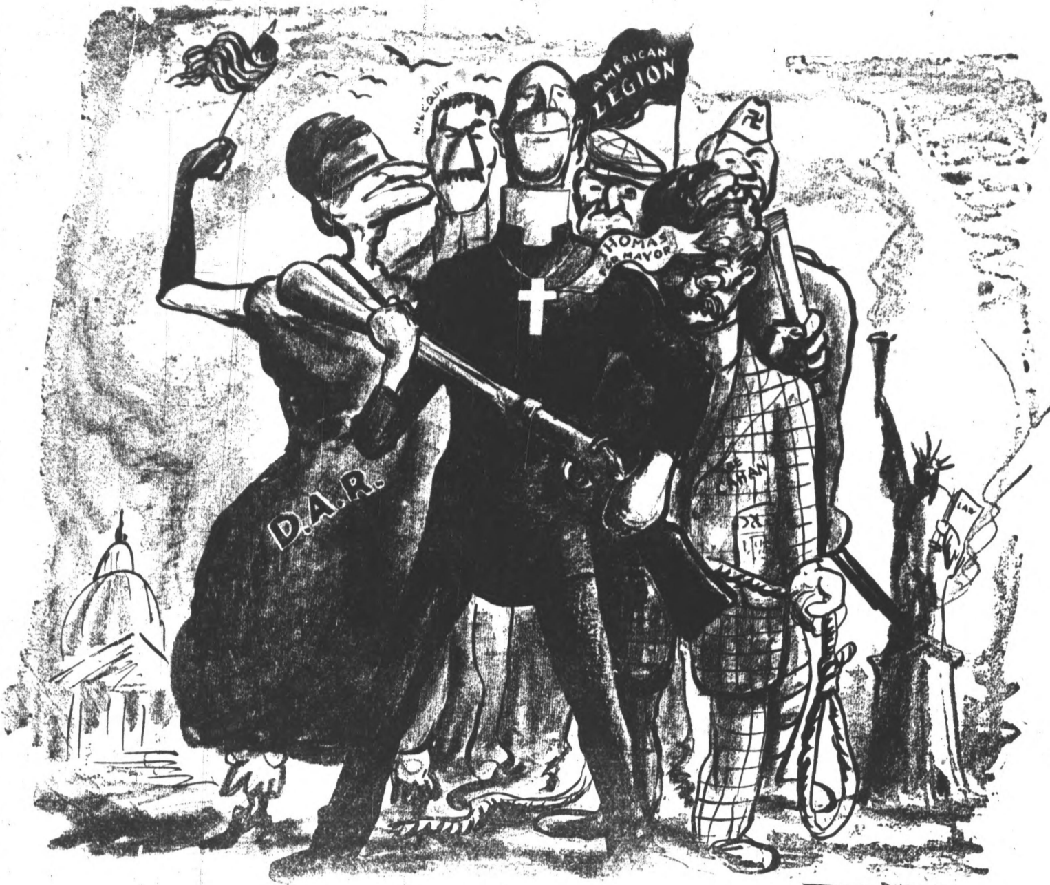
The Socialist Party declares that the workers must fight for a more "efficient" police force.

Rally to the support of the Daily Worker!