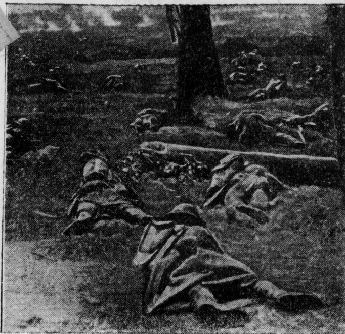
Dead workers on a battlefield who were slaughtered for the imperialists during the last world war. United States imperialism is now preparing the same fate, not only for American workers, but also for Latin-American workers and peasants. British imperialism, together with its French ally, is doing the same thing.