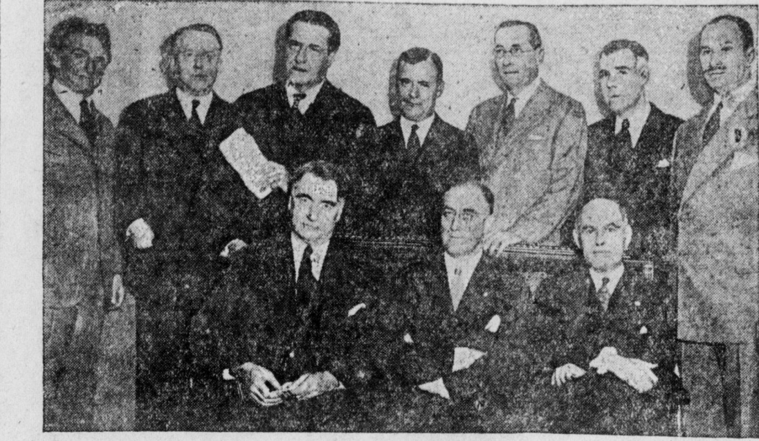
Photo shows Franklin D. Roosevelt, R. S. Copeland, and Herbert Lehman, democratic candidates for governor, U. S. senator, and lieutenant governor, respectively, of New York state, being "honored" as guests at a luncheon of open shop bosses. The open shoppers came out for Al Smith at this luncheon, thus again proving Al Smith's "liberalism" a myth.