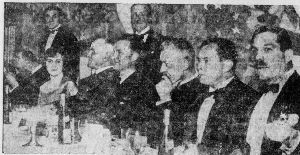
Photo shows Capt. Hugo Eckener, German militarist in command of the huge dirigible Graf Zeppelin, being entertained at a lavish dinner given at the expense of the workers of New York by the Tammany graft administration.