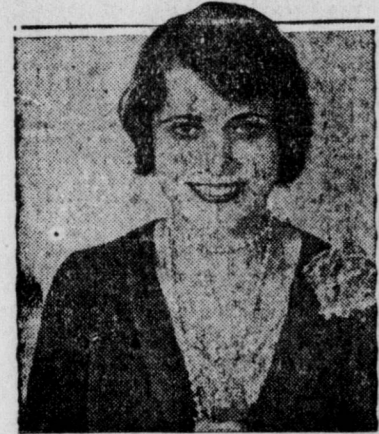
He promised to send me a diamond ring. He said he would get a divorce and then we would... I was in raptures.