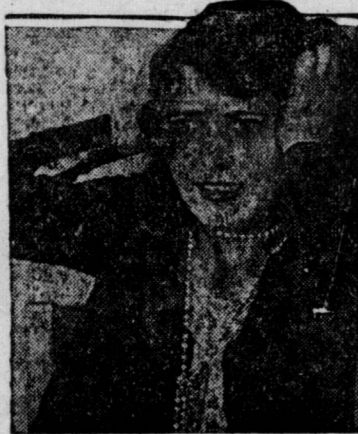
Suddenly he wrote that he must never see me again...

The above hectic episodes with their heart-breaking underdescriptions are part of a series running currently in one of New York tabloids. This travesty on a newspaper is read almost entirely by workers. Its circulation in one day exceeds that of THE DAILY WORKER for a week.