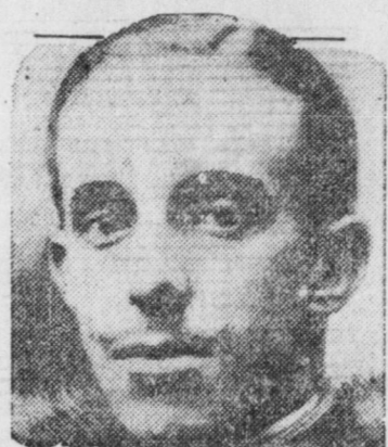
The House of Morgan has just announced the conclusion of a $25,000,000 loan to the Spanish government. The loan is planned to stabilize the peseta, which is another way of saying the fascist dictatorship of Primo de Rivera. The picture shows J. P. Morgan, at left, and the royal puppet monarch whose kingdom he now virtually owns, King Alfonso of Spain.