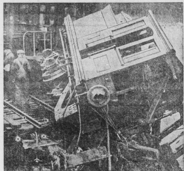
Trainmen on these cars of the Boston Narrow Gauge Line had a narrow escape when the locomotive crashed thru a bumper at the East Boston Terminal and went into the water. The picture shows the debris caused by the accident.