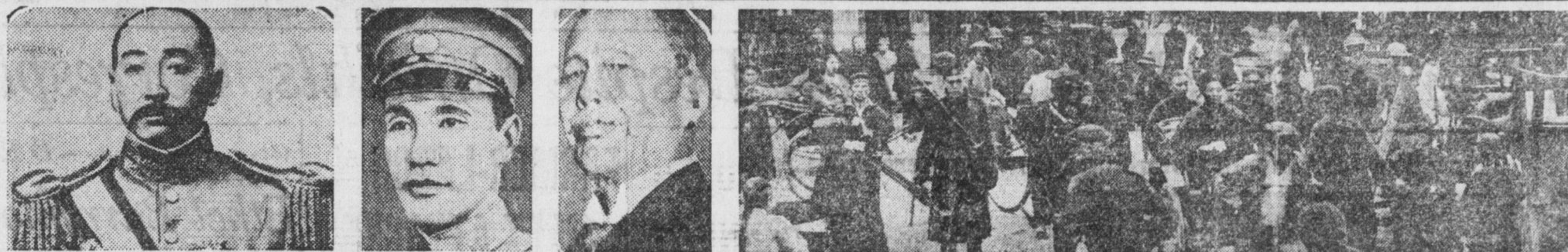
Photo at right shows view of Tsinan just before Japanese imperialist troops bombarded the city. From left to right are Chang Tso-lin, Manchurian war lord; Chiang Kai-shek, who is leading the armies of the reactionary Nanking regime and Baron Tanaka, premier of the Japanese imperialist government.