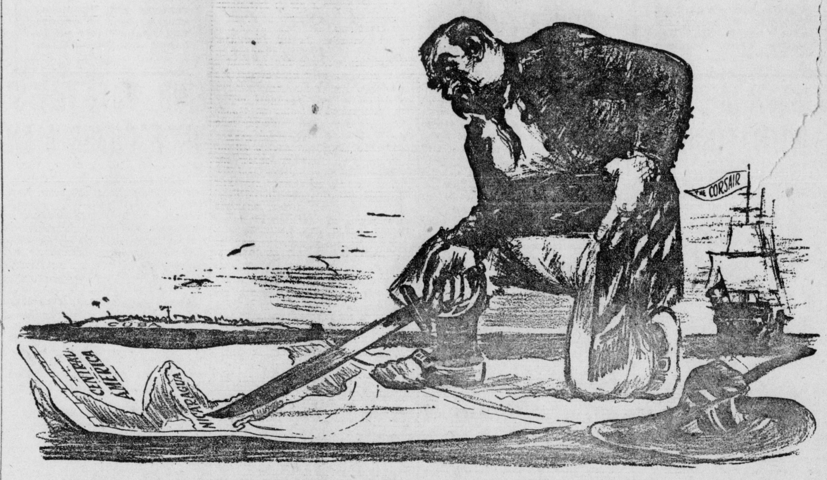
At Havana, Cuba, today, the imperialist pirates of Wall Street plan the bloody conquest of the Spanish Main. The chief of pirate captains-now as 200 years ago goes by the name of Morgan.