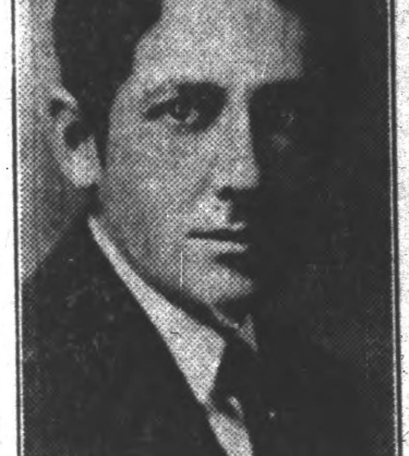
In "Gods of the Lightning," the tense drama based on the Sacco-Vanzetti case now at the Little Theatre.

BASLE, Switzerland, Nov. 1.—The results of the Swiss elections so far show that the Communist Party has polled 15,000 votes, a gain of 2,000 since the last election, but involving the loss of one seat in parliament.