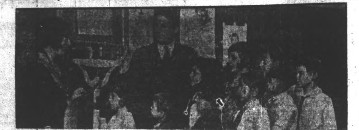
In the schools of New York City, the health of the thousands of school children are endangered by the cramped, inadequate and unsanitary schools provided for them by the Tammany graft administration. A sham "Health Day" is staged once a year, when the children's health is "examined."