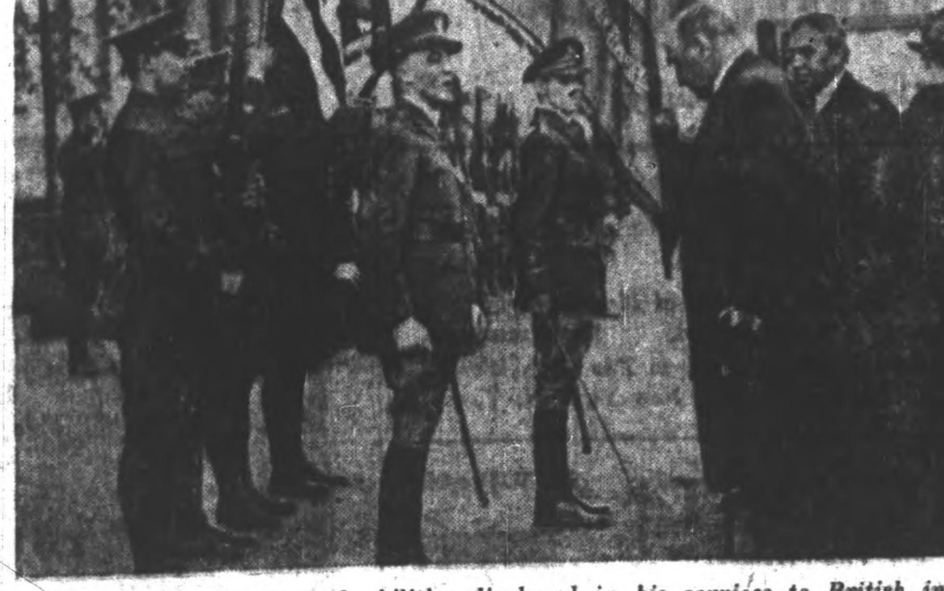
For the great intellectual abilities displayed in his services to British imperialism in Palestine, Field Marshall Allenby, now visiting this country, has been given the degree of doctor of laws by New York University, a so-called institution of the higher learning. Photo shows the murderer of thousands of natives being received by American soldiers on his arrival at the university.