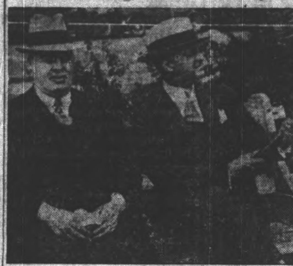
Lord Bothmers, left, brother of the late Lord Northcliffe, and owner of the Daily Mail, who owns a huge string of newspapers which has been spreading propaganda against the Soviet Union. Bothmers is photographed with G. Ward Price, the brass sheet director of the Daily Mail, during their recent visit to the United States.