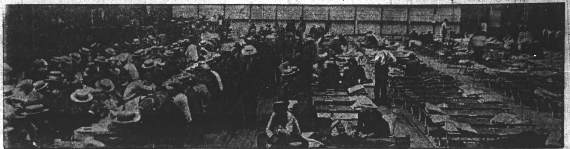
The photos above were taken during the last strike of the I. R. T. workers in July, 1926. The subway system was almost completely tied up because the men went out in a solid body. Thousands of habitual subway riders took to the busses. The photo on the left shows a crowd waiting in the rain for a bus to come along. The photo on the right shows a bunch of scabs, imported during the last strike from out of town, in the bunks provided for them in the I. R. T. shops at 147th St. and 7th Ave. The scabs were penned in under guard in the bunks, and were prevented from leaving them by the police.