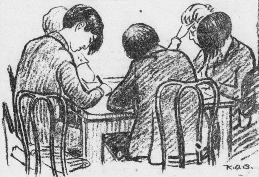
They are taking down in full all the speeches delivered at the convention. Later a report will be published in book form.