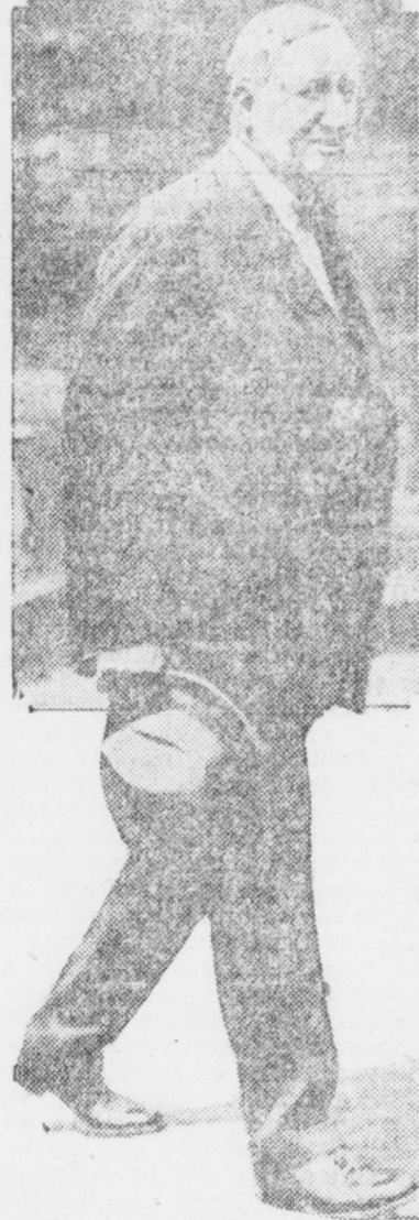
Photo of ex-governor Warren T. McCray of Indiana snapped as he was leaving Atlanta penitentiary after serving years of a ten-year sentence for using mails to defraud. Tom Mooney and Warren K. Billings are still confined in San Quentin prison, California.