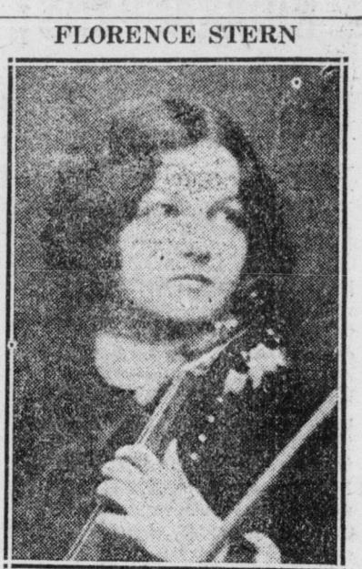
The brilliant violinist will be one of chief features at the Carnival and Fair next Saturday and Sunday.