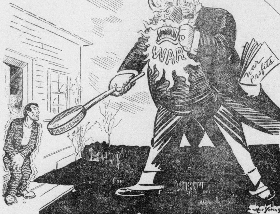
War is useful to the exploiter. When the lives of workers are not being demanded for battle sacrifices, the earnings of workers are being wasted in "preparedness" for battle.