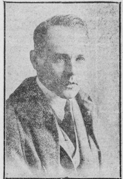
In "Queen High," now in its eleventh month at the Ambassador theatre.

B ERLIN, July 5.—Discussion of a Berlin-to-New York non-stop flight was given marked impetus today by the announcement of the Junkers airplane works that they are constructing a concrete runway for planes with especially heavy loads that would attempt record flights. Ever since Clarence Chamberlin and Charles A. Levine made their great flight from New York to Kottbus, Germany, there has been considerable talk of a flight from this country to the United States.