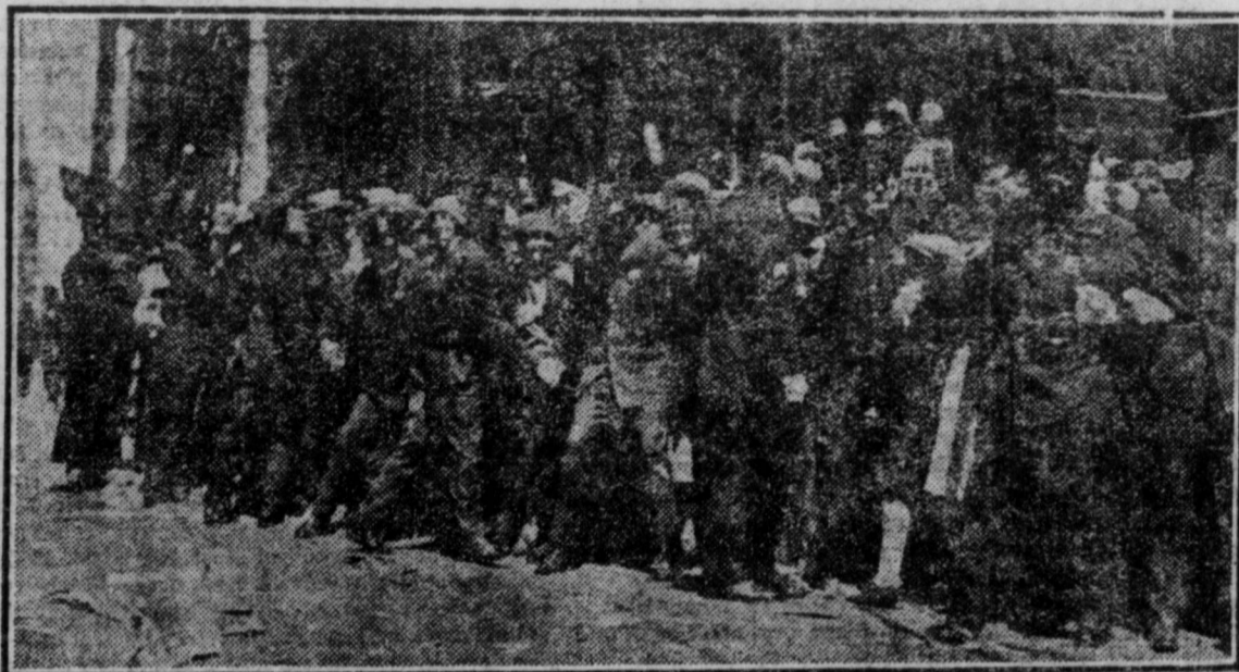
This snapshot shows the kind of work New York police have had to perform to prevent jostling crowds from overwhelming Colonel Charles A. Lindbergh. This photo was made an hour before he was due at this spot.