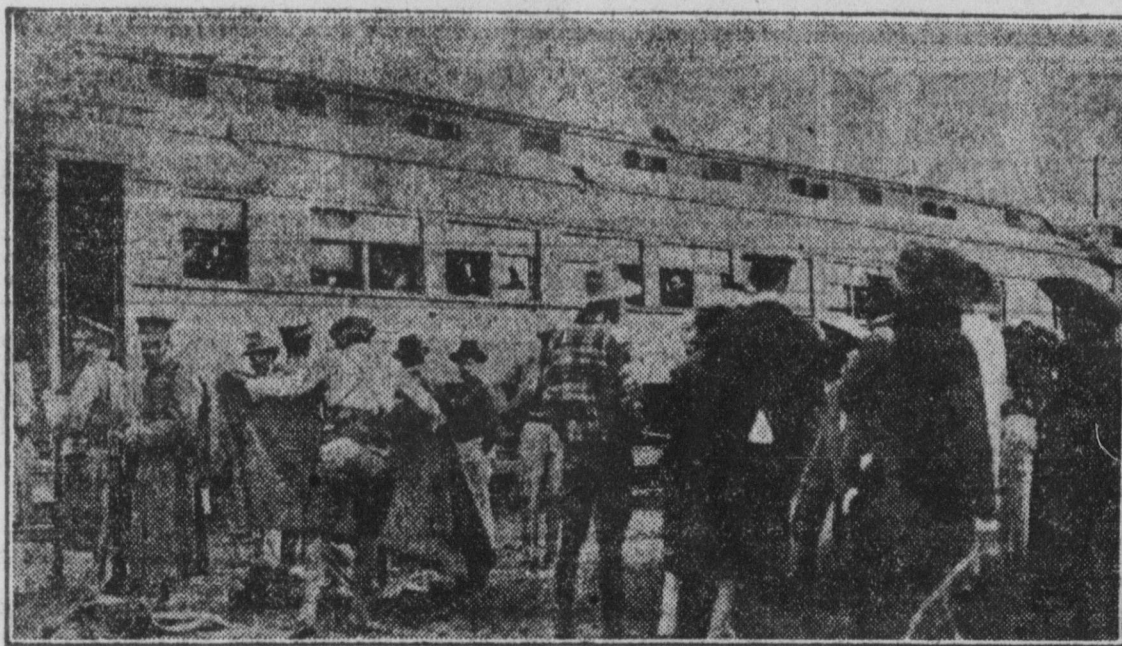
Exclusive picture of arrival of survivors of looted Mexican train at Empalme, Escobedo. The train, bound for Laredo, was stopped, attacked and the wooden cars burned, with loss of life.