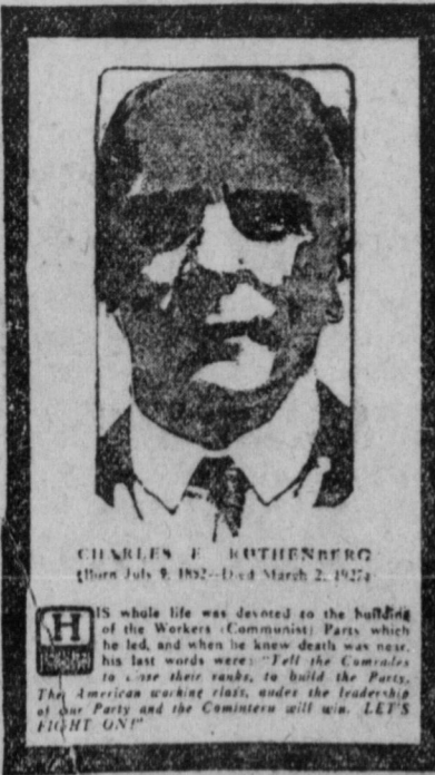
CHARLES E. RUTHENBERG (March 9, 1892 - March 2, 1927)