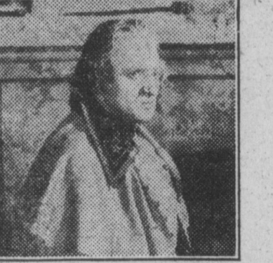
In Romain Rolland's "Wolves," a drama of the French Revolution which is being revived at the Yiddish Art Theatre tonight.

Galsworthy's reputation as a social seer only by saying that there must be a large and carefully preserved meadow in the minds of the fashionable, British and American intelligentsia. "Justice" is the reformism of Dickens minus the humor, freshness and ingenuity of the great Victorian. It is polite, it is grave, it is stiffly eloquent. There is nothing in it to offend the most hardboiled toady. Galsworthy merely criticizes a defect in a piece of machinery. He never questions the nature or uses of that machinery or the foundations upon which it rests.