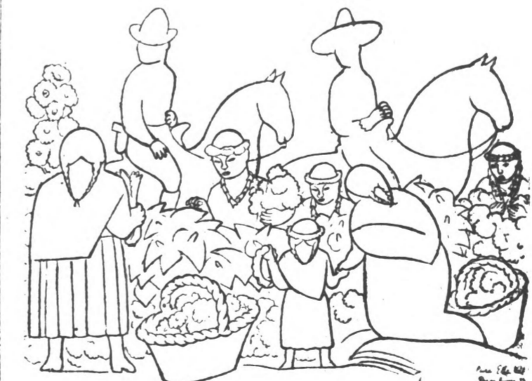
Mexican Festival —By Diego Rivera.

symbol of the power of labor to construct a new world far above the conventional "art appreciation" of the money kings. Unlike that it is not parasitic but creative. It does not rob from the rest of the world but builds for the world to possess. It will not be long before it gives the world a plastic beauty that is powerful and new.