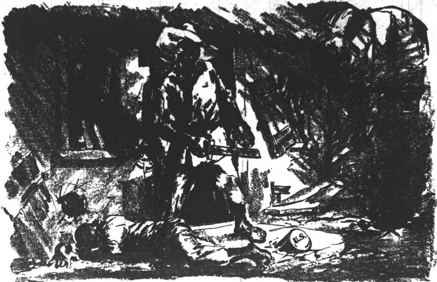
"Give me liberty or give me death!"