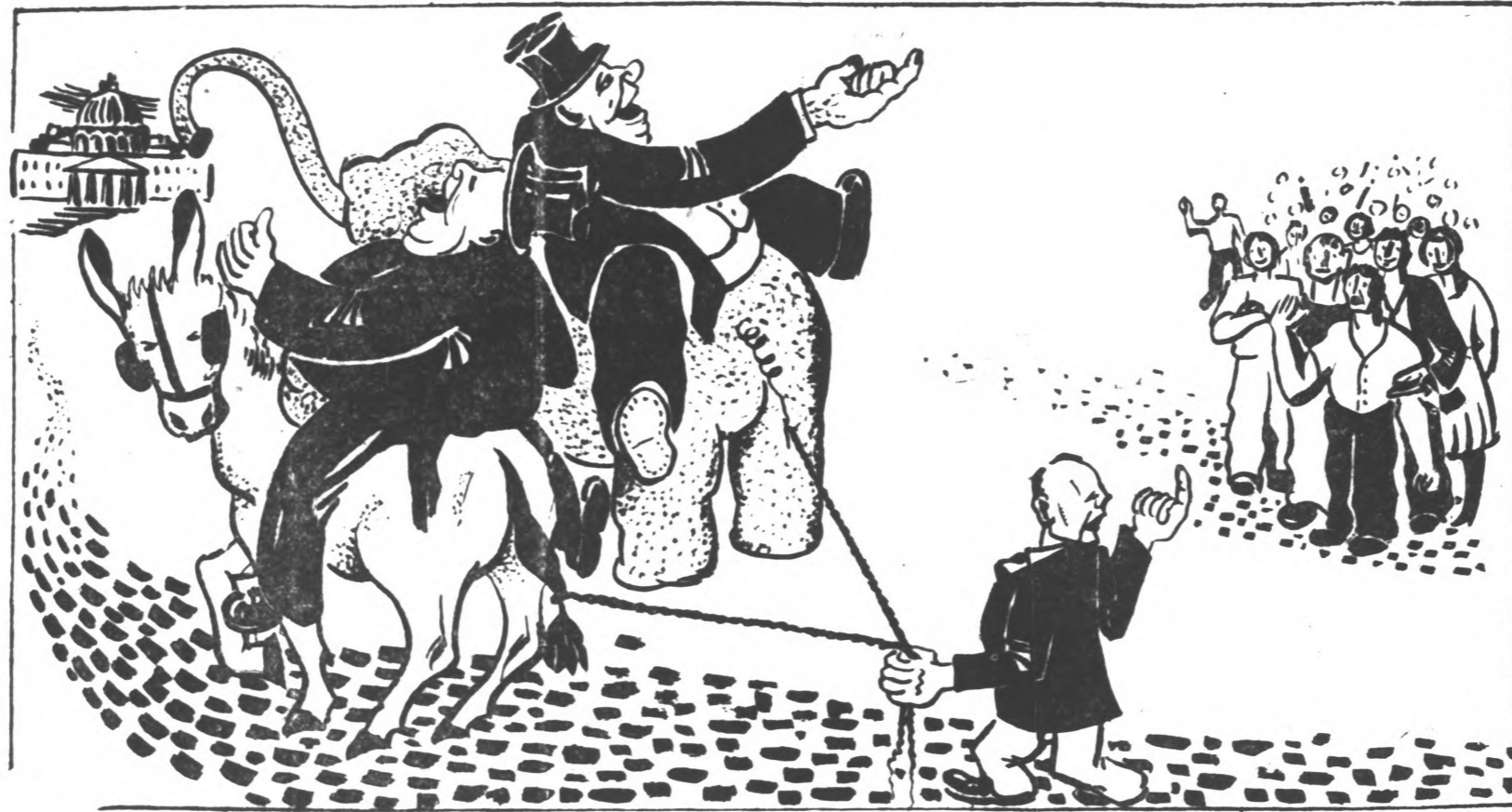
"Come on you workers, grab one of these beasts and lead him up to the White House."