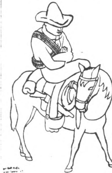
The Armed Peasant—by Diego Rivera

On the other hand, all this contrasted with the strong plastic beauty that is developing in the city of skyscrapers. This was to me the