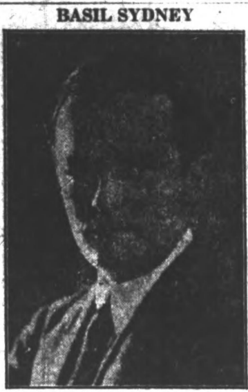
Head of the Garrick Players who will open their season next Tuesday at the Garrick Theatre with a modern dress version of "The Taming of the Shrew."