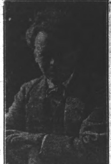
Conductor of the Philharmonic Orchestra, who will direct the opening concert of the season at Carnegie Hall this evening.