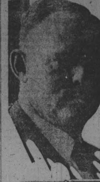
Frank Dow, above, acting commissioner of the bureau of customs of the treasury department, is the final judge or censor of foreign publications coming to the United States. If they are obscene it is the duty of the customs office to bar them from circulation within the United States.