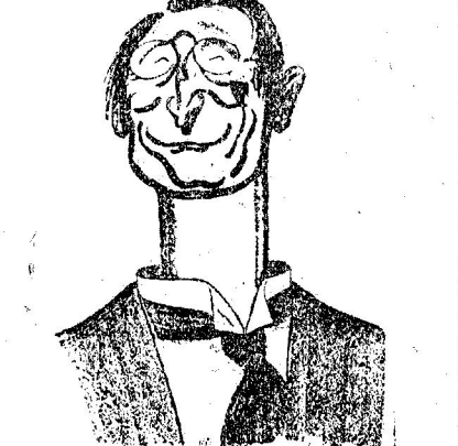
Head of a faction of Irish Republicans who recently returned to Ireland after a visit to the United States.

The Second Stage of the Chinese Revolution. The coup d'Etat carried out by Chiang Kai-shek signifies the abandonment of the revolution by the national bourgeoisie, the formation of a centre of national counter-revolution and bargaining by the right-