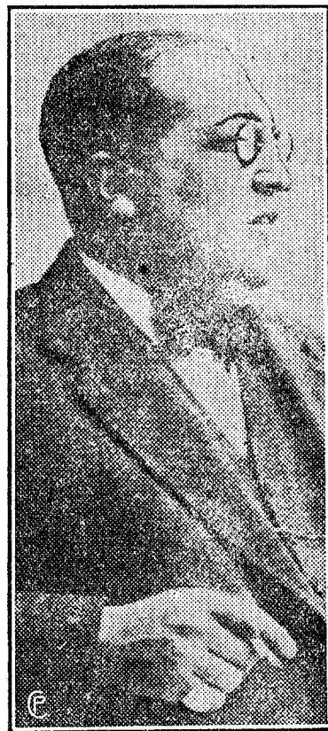
A new portrait-snap of Genaro Estrada, Mexico's new minister of foreign relations. He has the reputation of being a tactful diplomat.