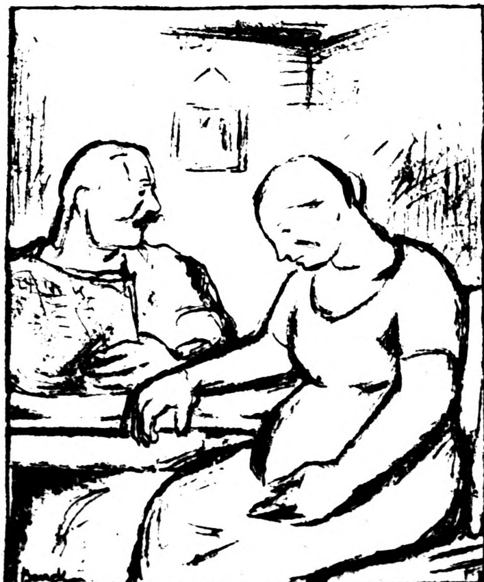
Husband: When the little one comes we will have to take Jimmy out of school and find him a job. George will have to sell papers to help out.

Organize Along with the Workingmen in Struggle Against Exploiters!