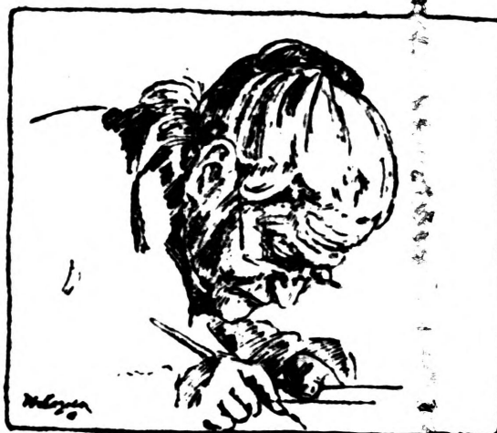
Most Famous Living Woman Revolutionist.