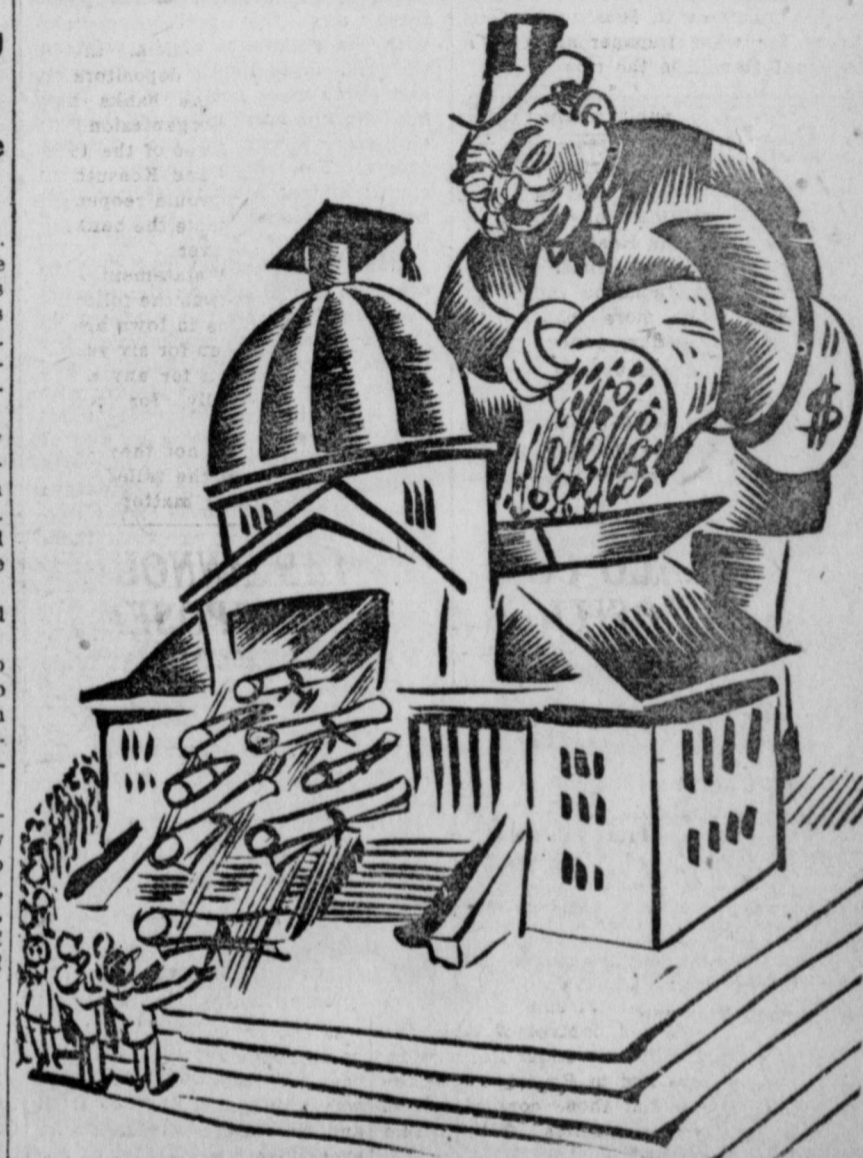
Wall Street Turns Gold Into Laws.