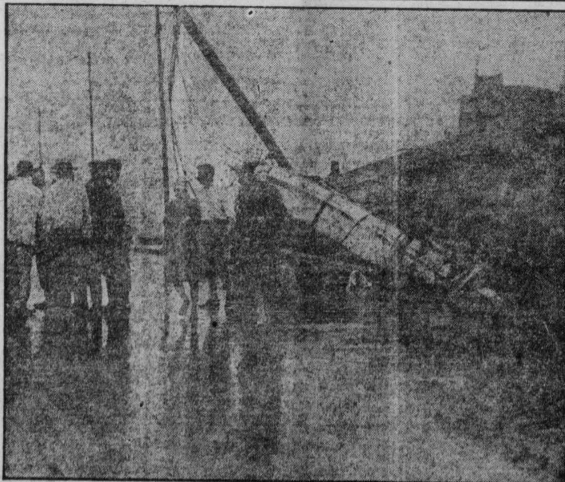
Survivors of the Miami storm are seen searching along the waterfront for friends and relatives lost in the mael of the hurricane. The shattered skeleton of a yacht lies on the breakwater, tossed there by the storm. Scenes of utmost desolation are found thruout Miami and its suburbs as the community seeks to re-establish something like its former order.