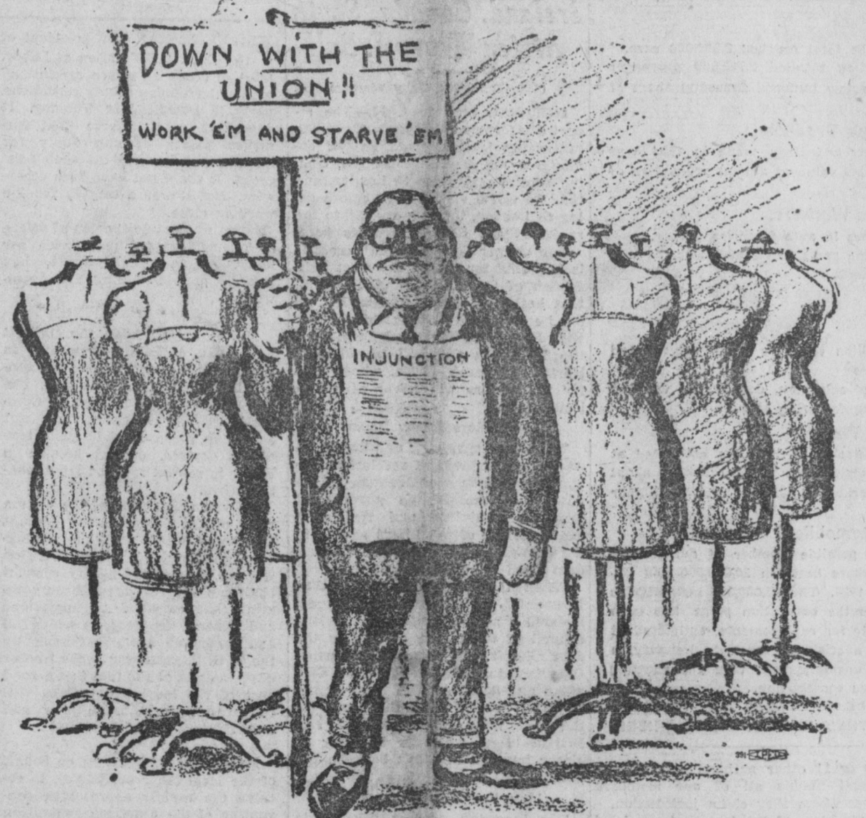
Backed by thousands of dressmakers' forms the garment bosses of New York cry for the destruction of unionism.