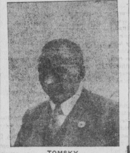
TOMSKY, President of the Soviet Unions, denied admission to England to attend T. U. C.

A Contrast of Classes. "Considered from a logical class point of view the conservative government acted logically and correctly according to its bourgeois class interests. It knows what it wants and that what it wants is the lowering of the standard of living first of all of the miners and then of the workers of Great Britain in the other branches of industry, for it is only the first blow which is being delivered at the miners.