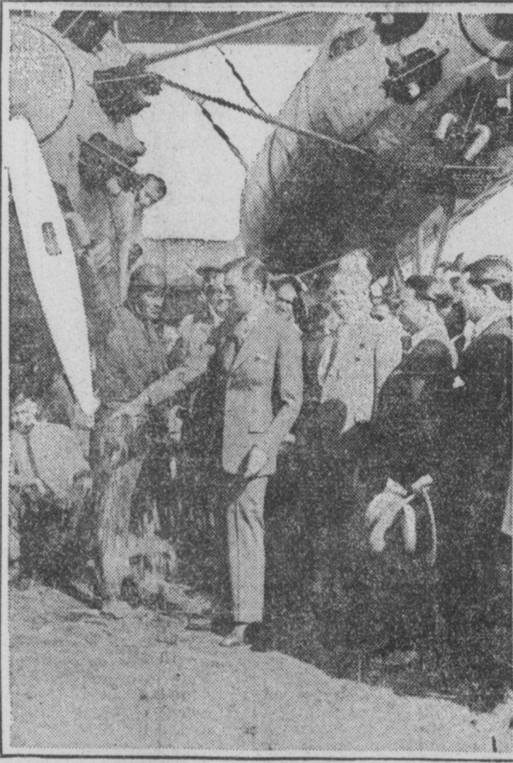
The great Sikorsky bi-plane is shown here being christened by Mayor Walker of New York, preparatory to its attempted flight to Paris. The success of this venture will make commercial aviation between this country and Europe an accomplished fact. But it will be many years before anyone but the wealthiest plutocrats will be able to fly at ease over the expansive sea to Europe in a few hours.