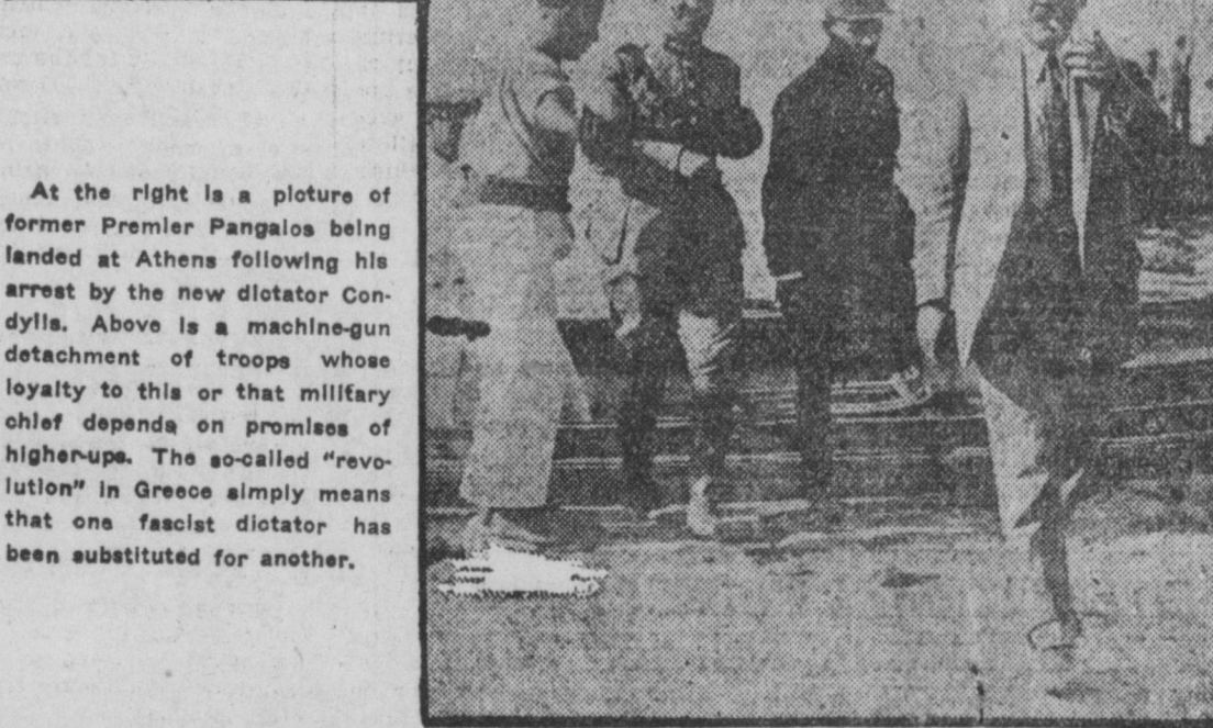
At the right is a picture of former Premier Pangalos being landed at Athens following his arrest by the new dictator Condylis. Above is a machine-gun detachment of troops whose loyalty to this or that military chief depends on promises of higher-ups. The so-called "revolution" in Greece simply means that one fascist dictator has been substituted for another.