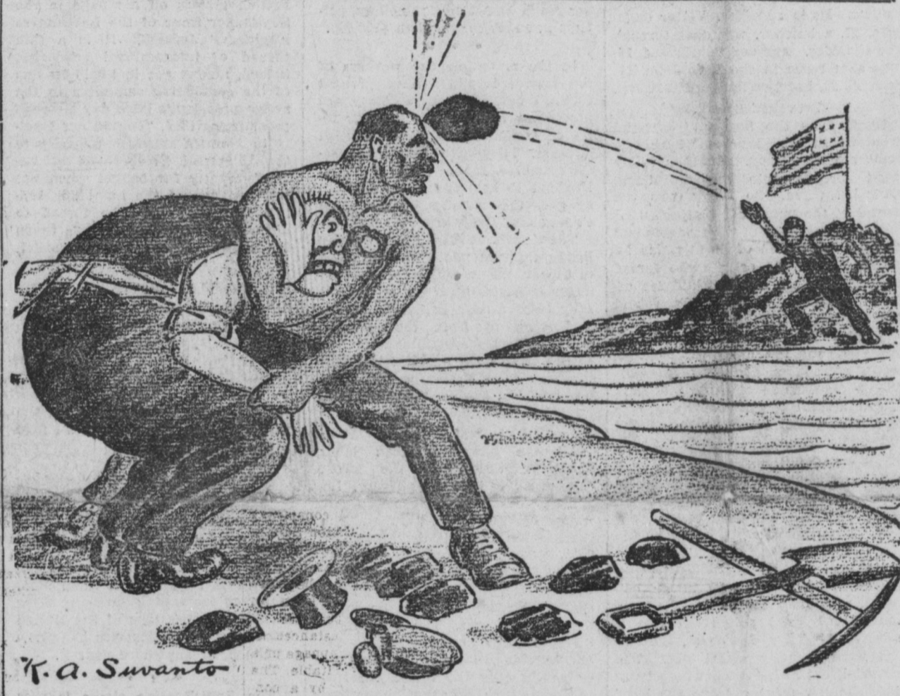
BRITISH MINER: "Must I loosen this excellent grip of mine on this damned coal baron only because that American brother of mine bombards me with scab coal?"