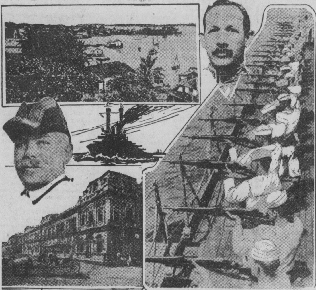
Here are views showing men and places involved in the latest disturbance in Central America in which again American marines are hastily dispatched ostensibly to "protect American life and property," but actually to put down the rebels and to keep in power President Chamorro of Nicaragua, a tool of Wall Street whose chair is threatened. At the top: View of Bluefields and President Chamorro. Other photos show U. S. marines in Southern waters, Rear Admiral Latimer, and government palace at Managua.