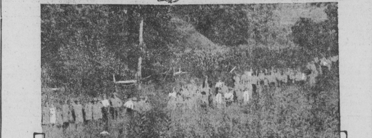
As the photos show, women and children are playing important parts in the long drawn-out strike of the miners of West Virginia for closed shop and decent working conditions. Above, women at work in one of the gardens of a barracks village near Fairmont. Below, men, women and children walking from their barracks to the picket line outside the mines.