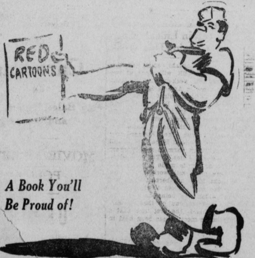
A Book You'll Be Proud of!

Now the Abyssinians have granted the British government the right to dam Lake Tsana and provide a water supply to irrigate their newly opened cotton growing region in the Sudan. The British government has evidently decided that slavery is not in Abyssinia, at least as long as the natives there do not interfere with the water supply and at least while Mussolini persists in double-crossing the British navy by flirting with the idea of building fortifications across from Gibraltar.