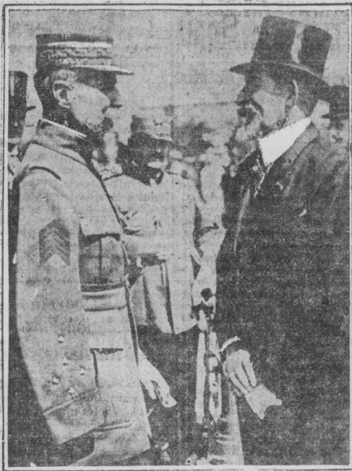
When a French general visits any of the Balkan countries you can rest assured he is there for business. Here we see Gen. Gourand, of the French army, conversing with King Ferdinand of Roumania. France keeps its fingers in the Balkan pie. One reason is that the Balkan states, like the Baltic states, are buffers against the Soviet Union.