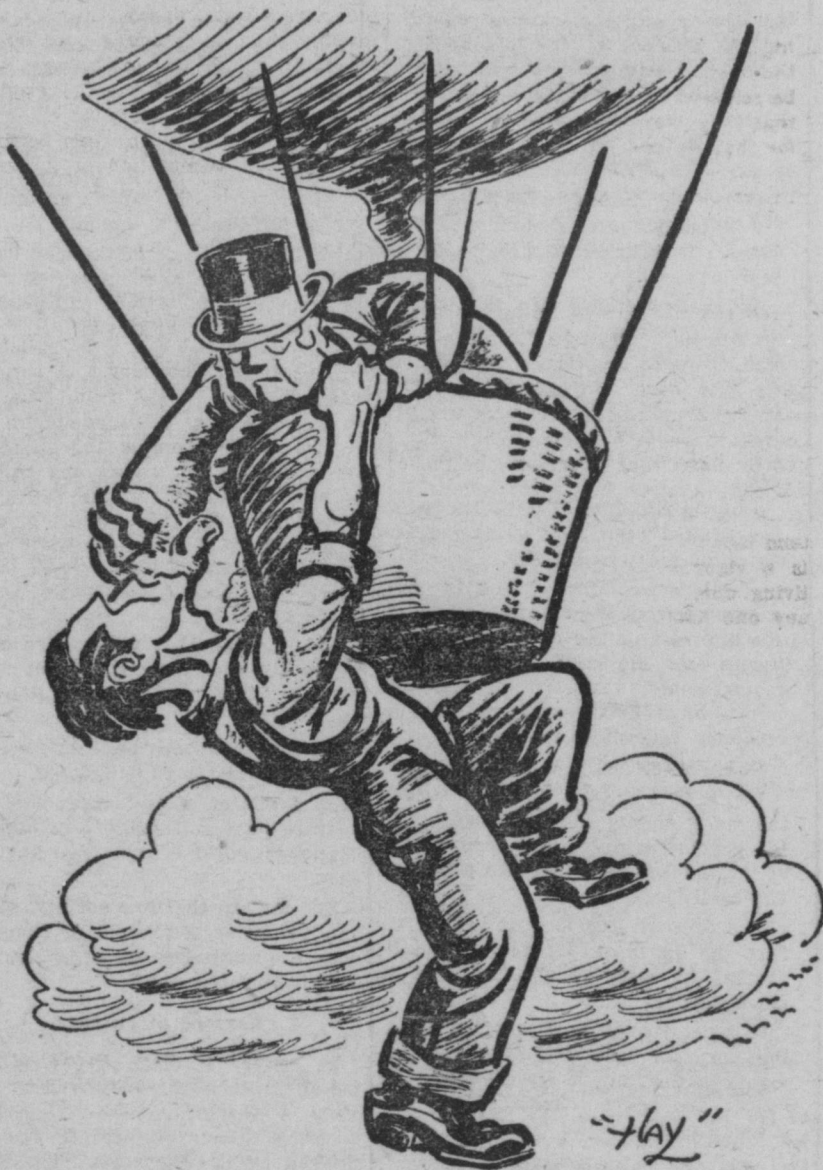
Capitalism, trying to rise from the ruins of war, wants to get rid of ballast, and tries to cast the worker down to a lower standard of living—says "Hay" Bales, the cartoonist.