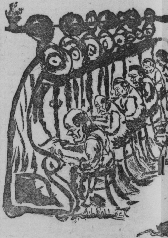
Pay the Costs of the Bosses' War

and down in his grasp like a loose piston rod. The rest of the miners turned their heads. The steel of bayonets is a hard wall to scale.