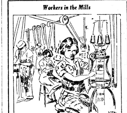
The American Worker Correspondent 1113 W. Washington Blvd., Chicago, Ill.