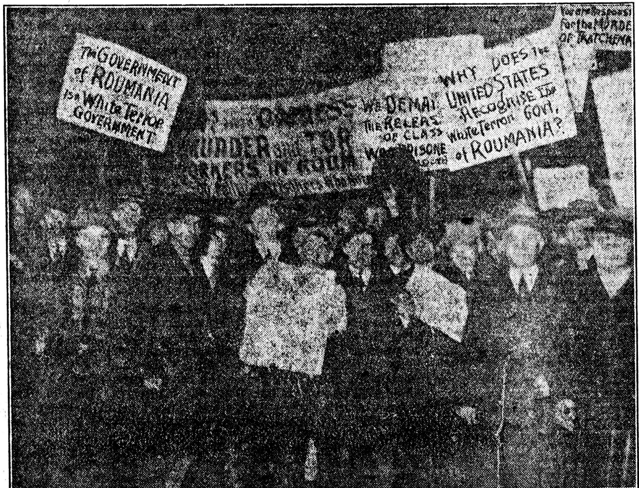
Here is a belated but none the less interesting picture of how workers of Chicago greeted Queen Marie. It shows a small section of the crowd that gathered before City Hall after the demonstration at the depot. The photographer pulled his flashlight just two seconds before the police phalanx charged the crowd.