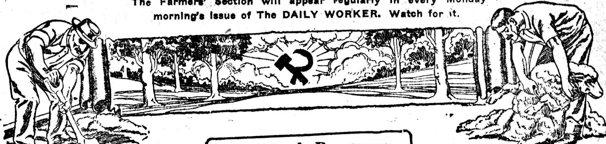
The Farmers' Section will appear regularly in every Monday morning's issue of THE DAILY WORKER. Watch for it.

MOSCOW, Nov. 7.—The Gostrog (State Trade Administration) has finished its task of purchasing agricultural machines abroad for the U. S. S. R. in 1925-26 operative year. More than half of the machines were bought in America. Tractors have been purchased for the sum of over eight million rubles. The conditions of credit abroad were quite acceptable and satisfactory.