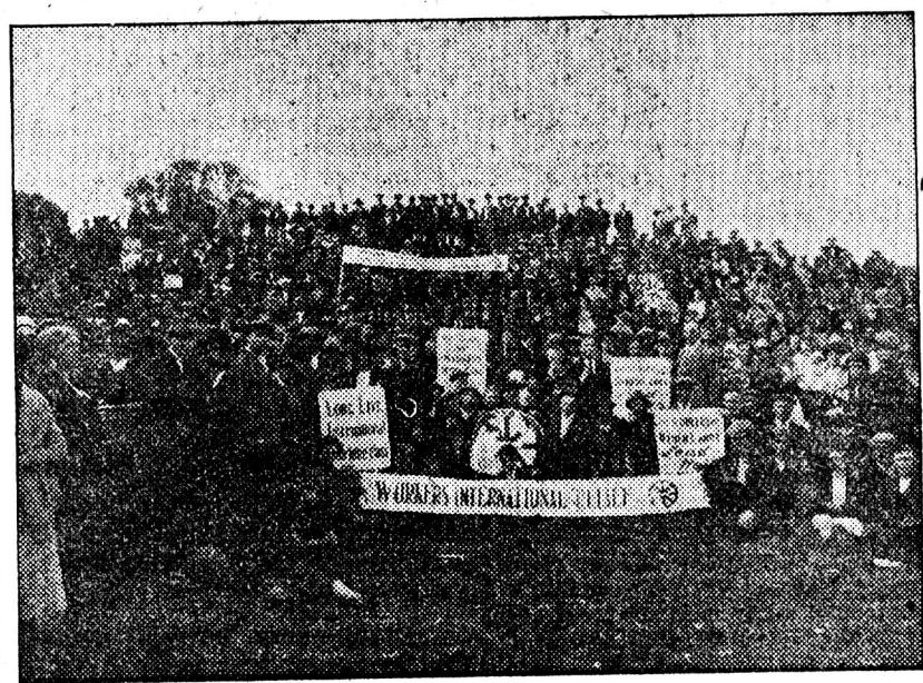
Thousands of British miners are receiving help collected from the world's workers by the Workers' International Relief of which the International Workers' Aid in the American Section. Send your contribution to the I. W. A., 1553 W. Madison St., Chicago.