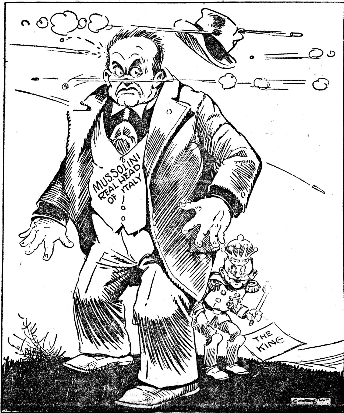
The fatal regularity with which Mussolini has been missed by crack pistol shots and past masters in the art of bombing, while causing some suspicion in the minds of skeptics has only now been revealed as well calculated bogus attempts engineered by the fascist themselves for the purpose of whipping up national sentiment and enhancing the prestige of the head fascist.