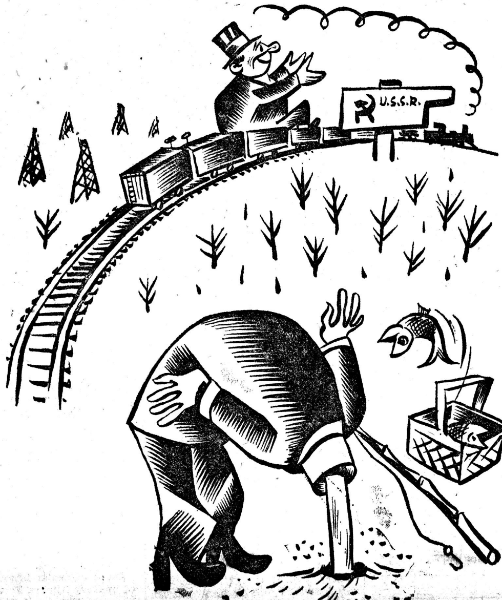
Coolidge Can't See the Road Running Toward the Soviet Union.