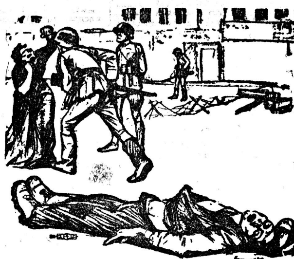
An Episode of the Bessarabian Terror (From a Roumanian peasant paper)

THE Bessarabian peasants and the workers of the central city of Kishinev have had a long tradition of struggle against absolutism. In 1903, and again in 1905, Kish-