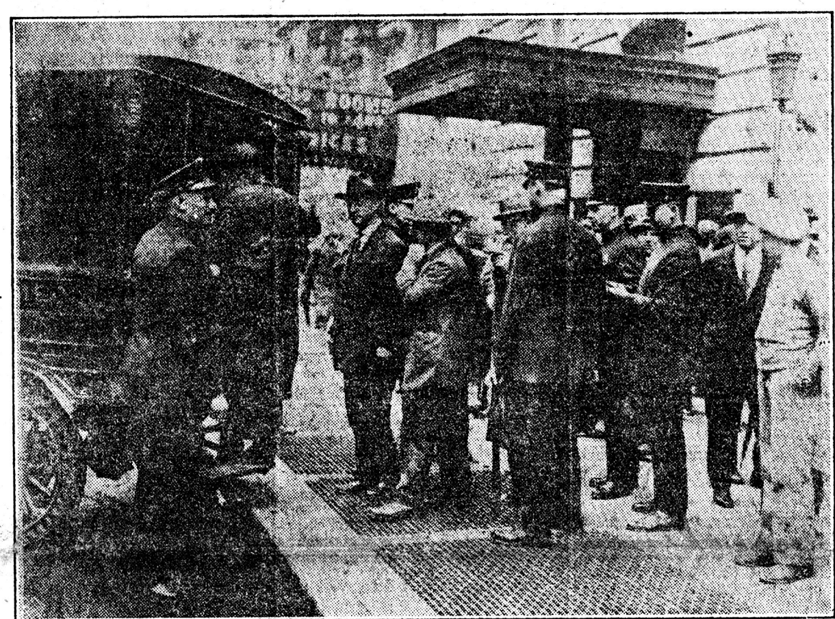
You did not. But here is a view of New York garment strike pickets being put into the "Black Maria" to be taken to jail by policemen who would never think of arresting the garment bosses for their abuses and thuggery against the workers.