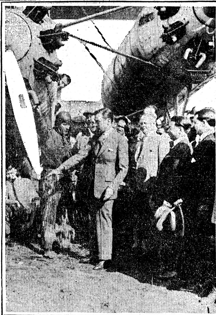
The great Sikorsky bi-plane is shown here being christened by Mayor Walker of New York, preparatory to its attempted flight to Paris. The success of this venture will make commercial aviation between this country and Europe an accomplished fact. But it will be many years before anyone but the wealthiest plutocrats will be able to fly at ease over the expansive sea to Europe in a few hours.