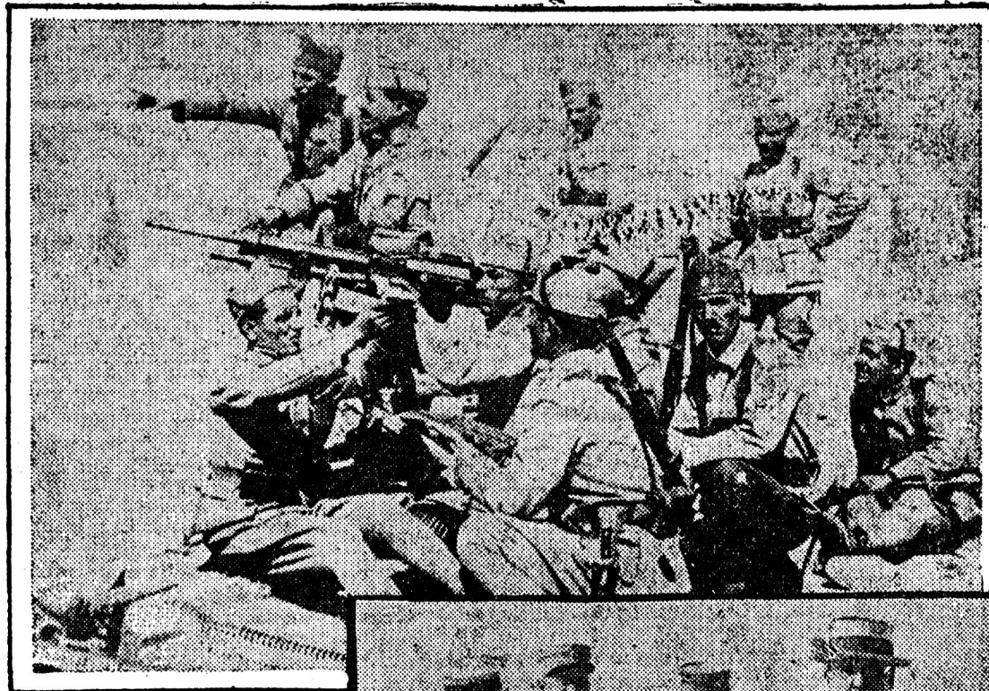
At the right is a picture of former Premier Pangalos being landed at Athens following his arrest by the new dictator Condylis. Above is a machine-gun detachment of troops whose loyalty to this or that military chief depends on promises of higher-ups. The so-called "revolution" in Greece simply means that one fascist dictator has been substituted for another.