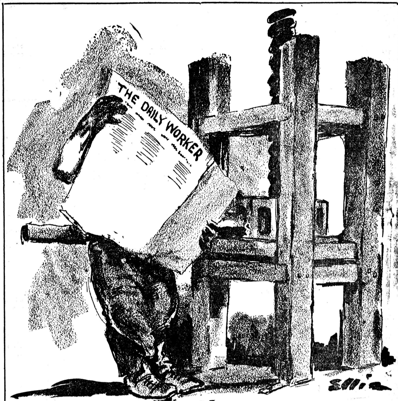
We will fight with and for THE DAILY WORKER