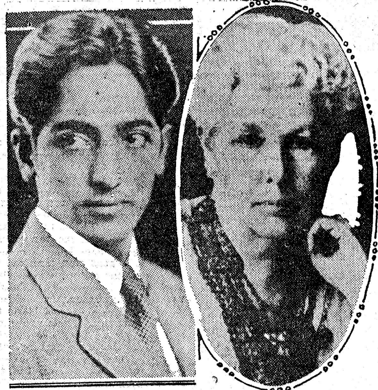
Krishnamurti and Mrs. Annie Besant.

Mrs. Annie Besant, leader of the world theosophical movement, is bringing to this country a new messiah by the name of Jiddu Krishnamurti.