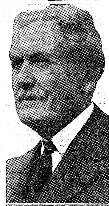
AMBASSADOR M. T. HERRICK

Is coming back to the States for a "brief vacation and to confer with the president on the delicate French situation." Wall Street is beginning to worry about the millions it loaned to France.